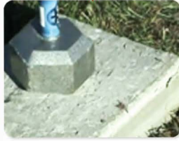
Improved Impact Resistance