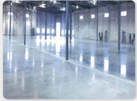
Less Shrinkage Cracking