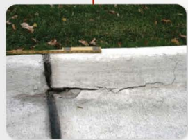
Better Joint Durability